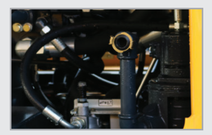
Optional high pressure flushing water pump for easier and more effective clean-out.

Our powerful pumps handle the harshest mixes with pumpable consistencies down to a 0" slump, with a max 2.5" (63mm) aggregate size.