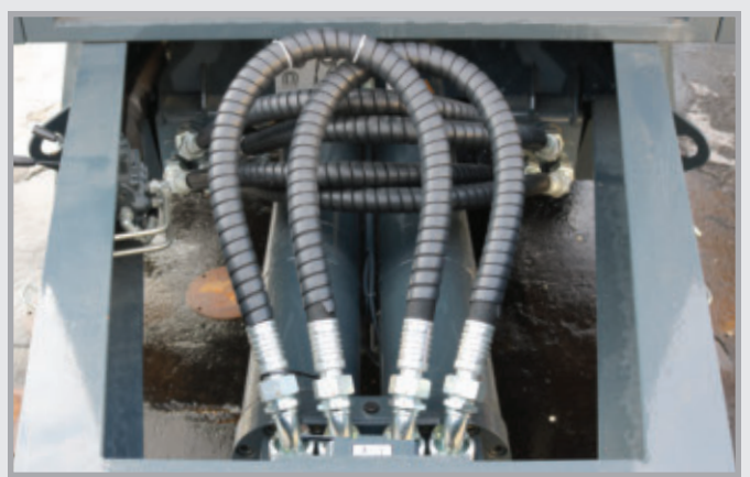
Optional rod/piston change-over system is designed to be fast and easy to facilitate output or pressure, when needed.

Special hard-chromed material cylinders and automatic central lubrication of the heavy-duty multi-piece piston cup assure long service life.