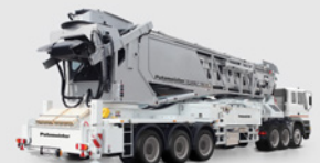
TELEBELT Horizontal Reach: 31.8 – 61 m Vertical Reach: 16.78 – 34.70 m