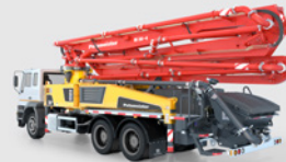
TRUCK MOUNTED PUMP Horizontal Reach: 31.4 – 37.6 m Vertical Reach: 35.6 – 41.6 m