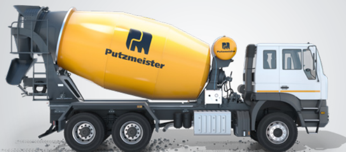
P7 PTO and P8 PTO