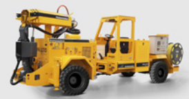
SHOTCRETE EQUIPMENT 4 – 30 m³/hr Horizontal Reach: 7 - 15 m Vertical Reach: 7.5 - 17 m