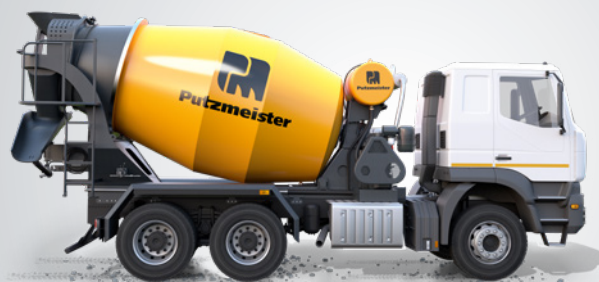
P6 and P7