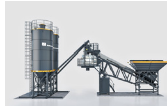
BATCHING PLANT 30 / 60 / 120 m³/hr