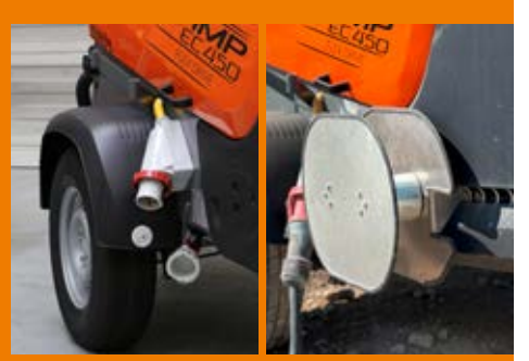
Simple connection with 63 A CEE outlet via provided 63 A cable