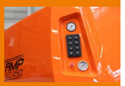
Straightforward operating panel with simple, robust keypad and two pressure gauges