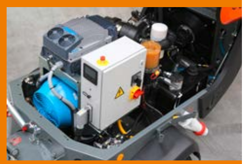
Powerful compressor unit with frequencycontrolled electric motor