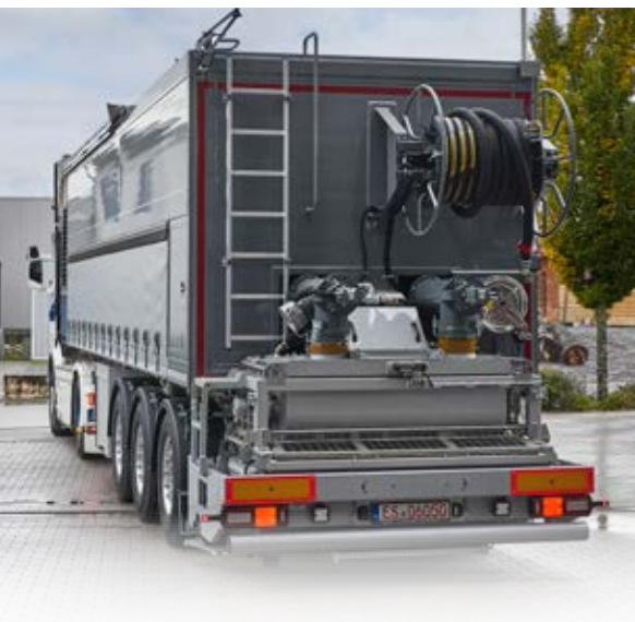
The TransMix TML 3200 is perfect for confined construction sites with little vertical space.