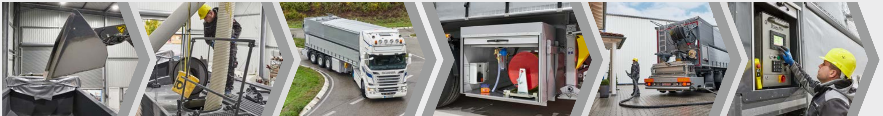
Loading the aggregate