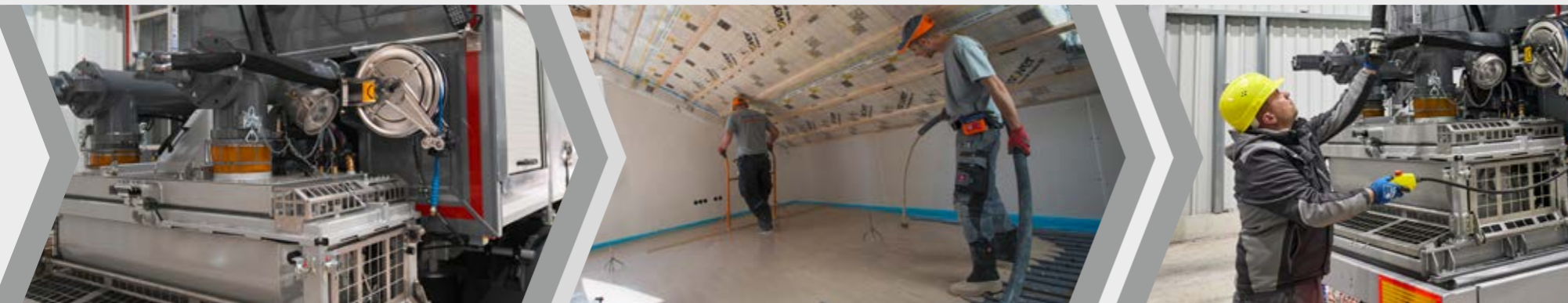
Fully automatic mixing and conveying