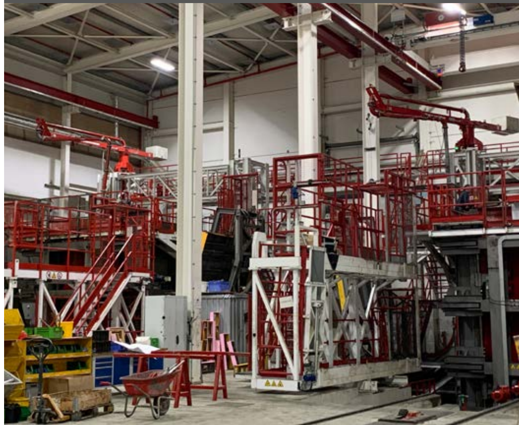
Two rotary distributors above formwork ▶