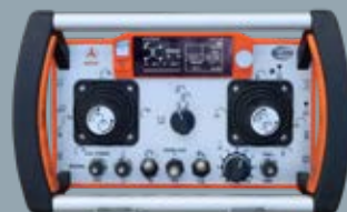
HBC radio remote control with display