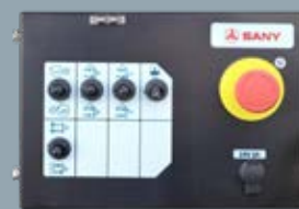
Maintenance control panel