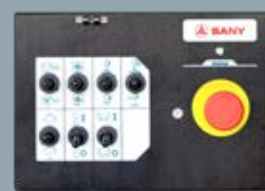
Local control panel