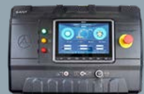
SYSD 10" touch display