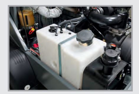
Powerful drive unit: Fuel saving and lowwear thanks to automatic engine speed control