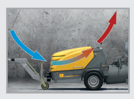
The innovative exhaust air routing and an additional exhaust duct improve the working area.