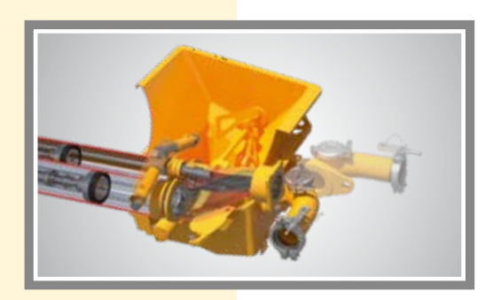
S TRANSFER TUBE