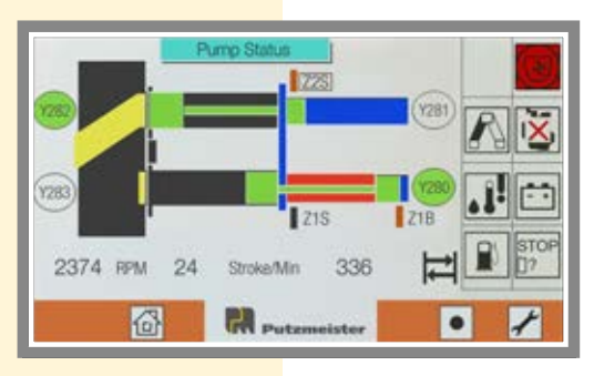
LIVE PUMPING DISPLAY