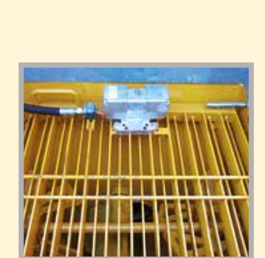
Agitator in hopper and grill with electric vibrator. Steel or polymer fibre pumping. Easy to open for maintenance and cleaning

Putzmeister has been world famous as the manufacturer of concrete pumps par excellence for over 50 years. Putzmeister is synonymous with top quality, innovation and reliability. The concrete pump mounted on the equipment is specially designed for concrete spraying, guaranteeing high performance, low pulsations and a long life for the wear parts. The efficiency of the Putzmeister concrete pump is unique.