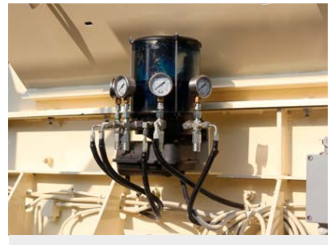
#5 Automatic Greasing System with pressure gauge on each delivery line

#4 External Sand Bin Vibrator ensures smooth flow of sand during batching