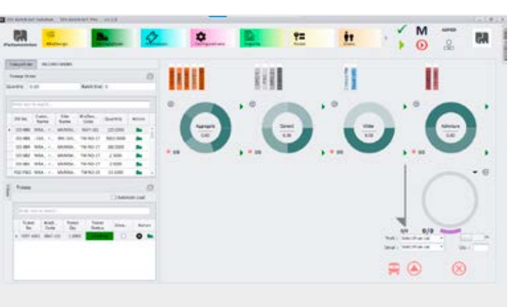
#7 Scada based software for real-time simulation and control