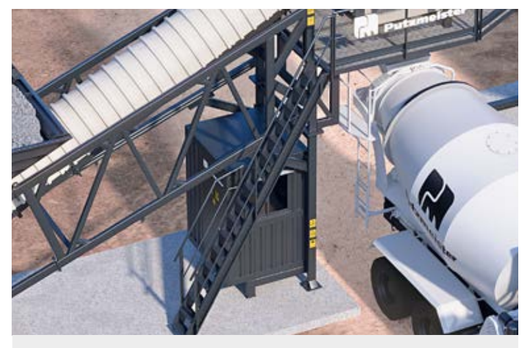
#6 In-built Control Cabin