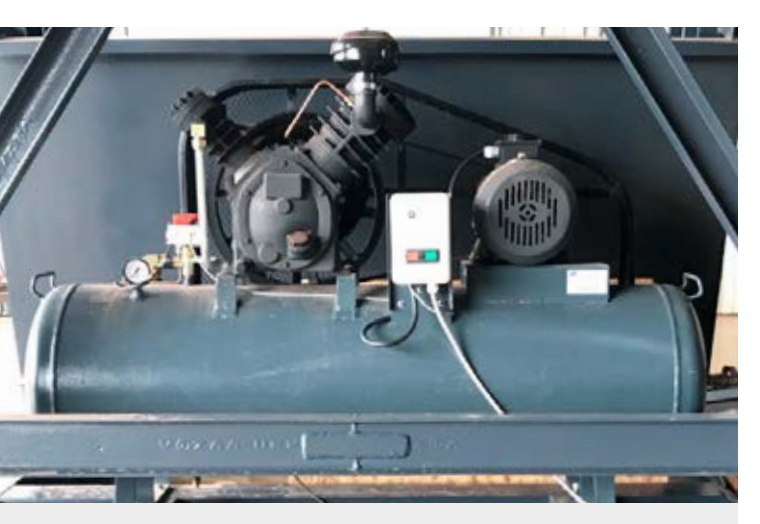
#8 Working pressure of up to 9 bar thanks to Double Stage Air Compressor